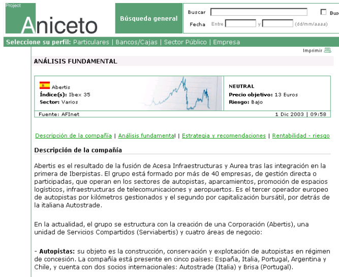
Fig. 4. Extended view of a Fundamental Analysis instance